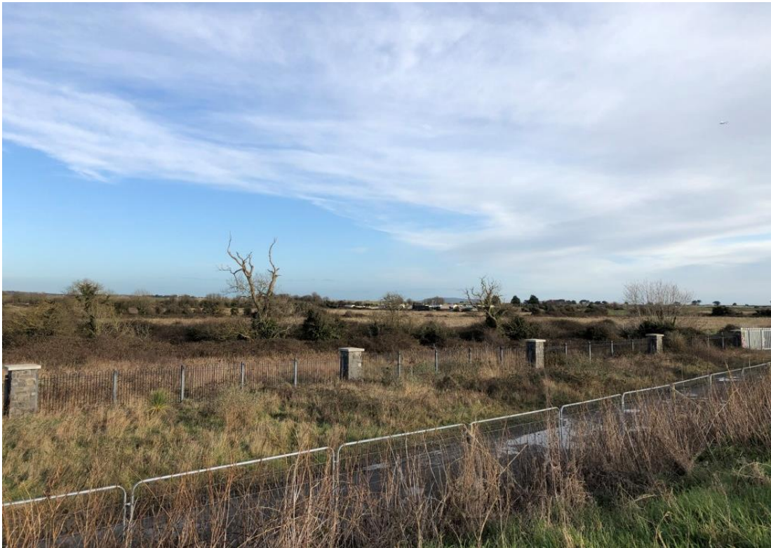
Photo 1: View of the northern boundary tree and hedgerow cover (T516 to G520). The hedgerow consists mainly of hawthorn and is overgrown. The trees within the hedgerow are all ash, some of which are in poor condition.

ash trees are in poor structural and physiological condition. There are no notable or high quality tree located within the boundary of the Application Site.