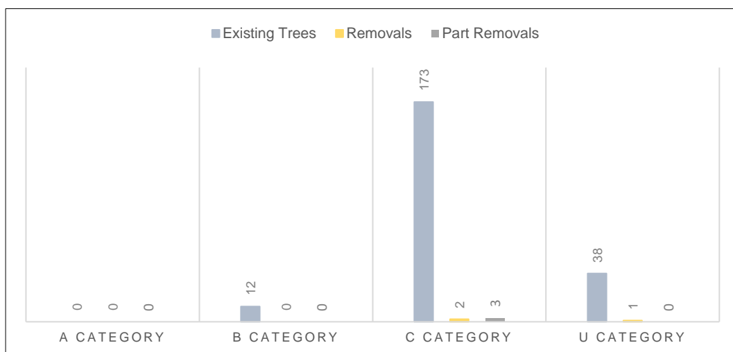
Figure 3: Breakdown of removals required to facilitate the development.