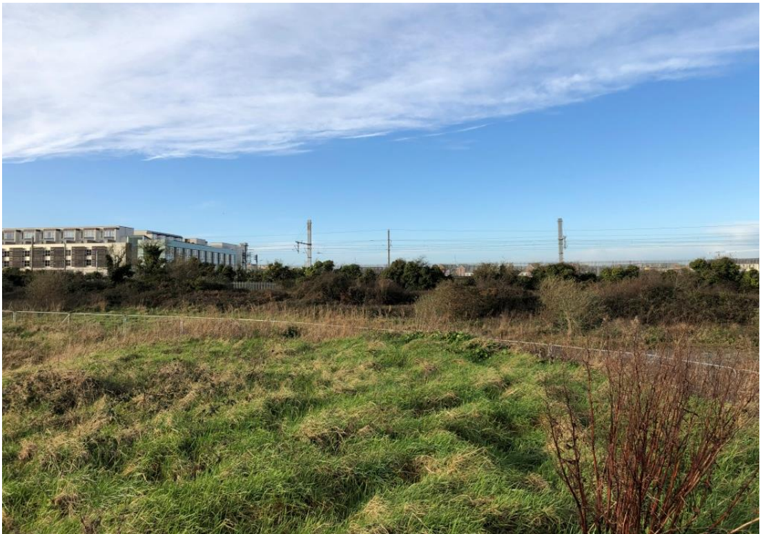
Photo 3: View of western boundary which contains a group of naturally regenerated elder and buddleja (G514).