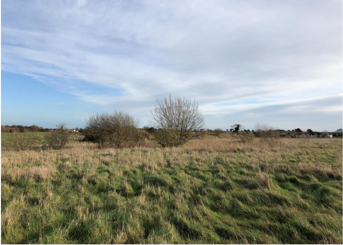
Photo 2: View of naturally regenerated willow trees located internally within the site (G515).